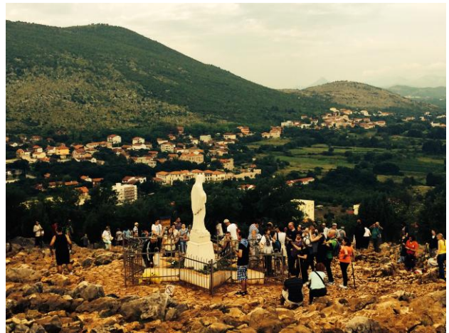
During the daytime we hiked through wild flowers and vineyards to Apparition Hill to see M'Lady. We gathered on the mountainside above Medjugore to pray, ask for help and give thanks.