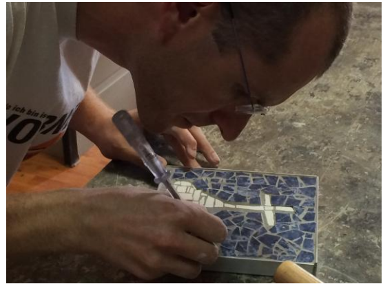
We helped the men of Mother's Village prepare for the 25 th International Youth Festival by making Crosses, lavender sachets and Mosaic tile pictures to support the village.