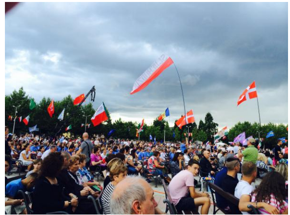
We celebrated with new friends at Mothers Village and Pilgrims from around the world.