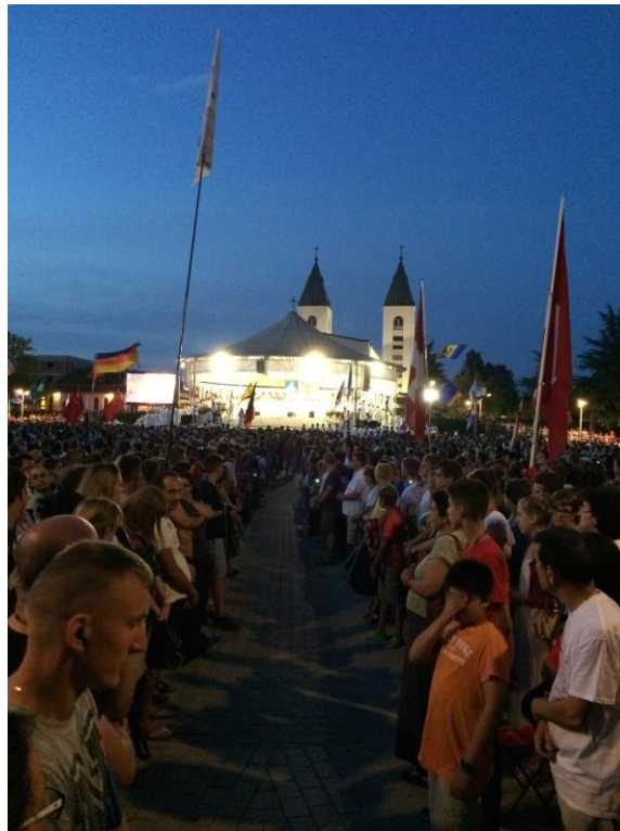
At evening Mass, when the aisles parted, over 80,000 Pilgrims from around the world shared the sacrament together.